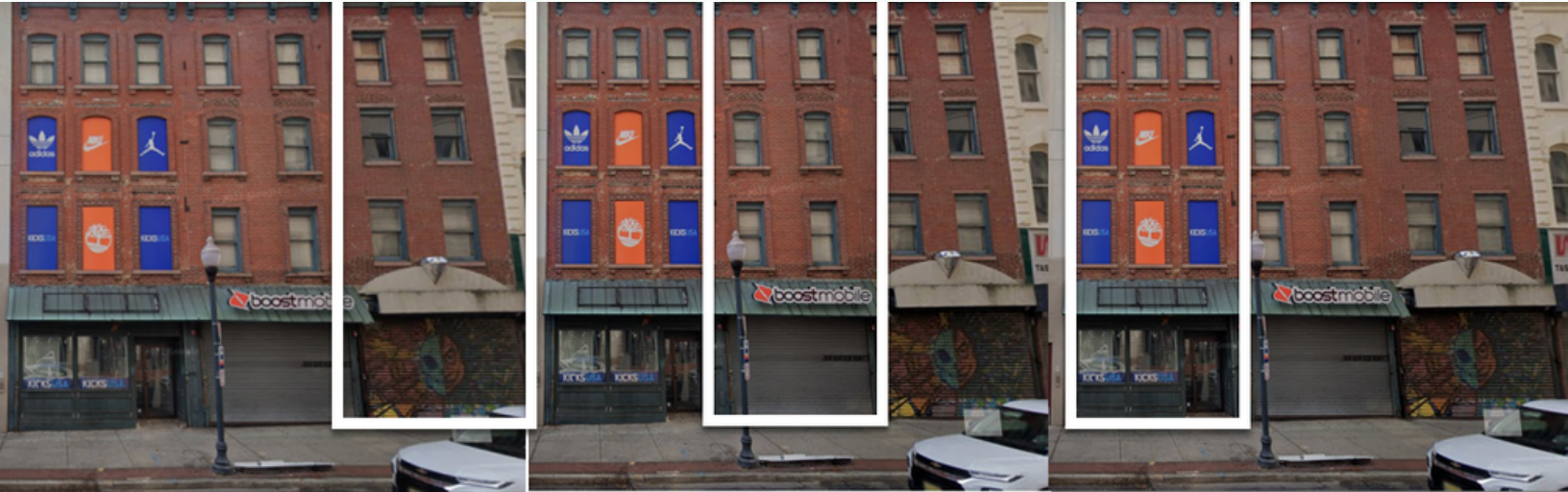
39 East State Street