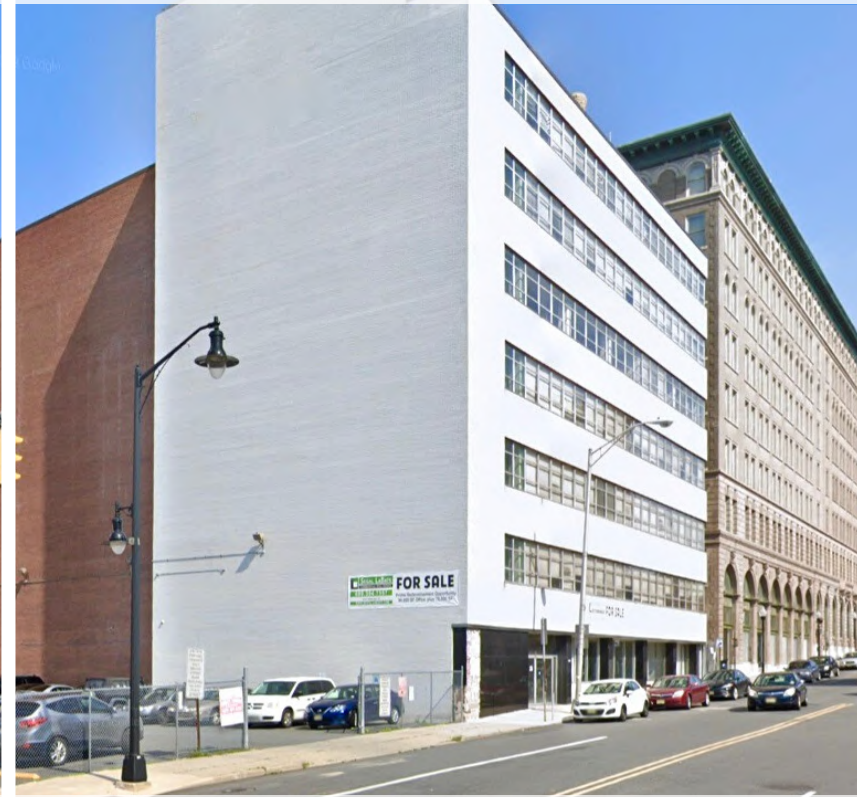
25 South Montgomery Street Trenton, NJ